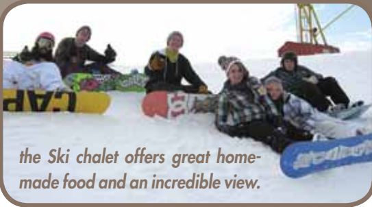
the Ski chalet offers great home-made food and an incredible view.